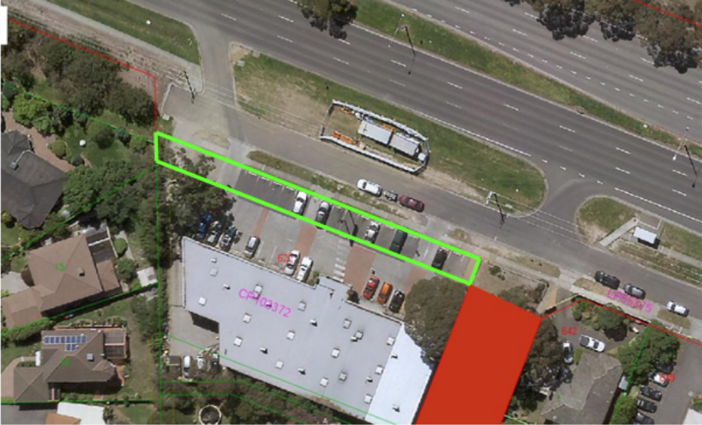
Image of large gum tree requiring landscaping for protection